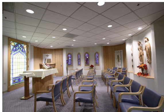
Bon Secours Baltimore Chapel

Saturday-Sunday at 12 Noon— Movies with Spiritual Themes are shown.